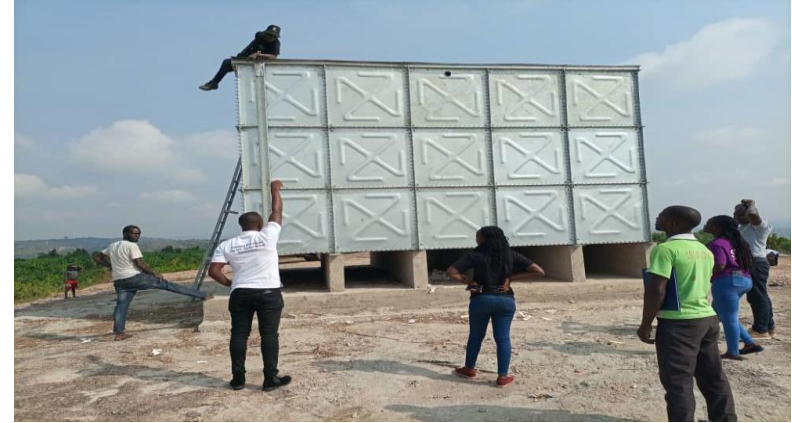
Fig. 1 & 2: Oxfam technical team on Site inspection of ongoing Solar works at Bujubuli water treatment plant and pressed steel tank construction at Mukondo B hill.